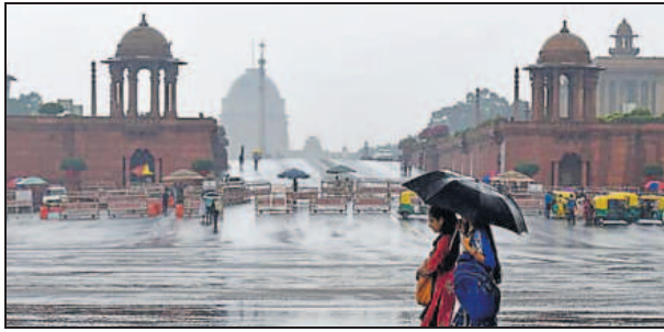
■ The onset of the southwest monsoon was also delayed by a week.

This year, the onset of the southwest monsoon was also