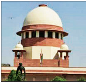
ALL FOR ACCOUNTABILITY

New Delhi: In a significant order intended to inject transparency and accountability in functioning of NGOs and other private institutions receiving substantial government funds, Supreme Court on Tuesday ruled that such bodies fall in the ambit of right to information law, making them liable under the RTI Act.